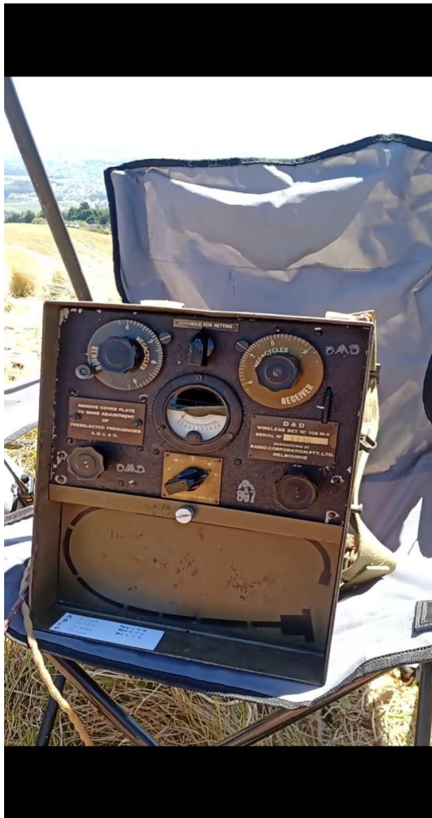
Aidan ZL3APB's No.108 set in action